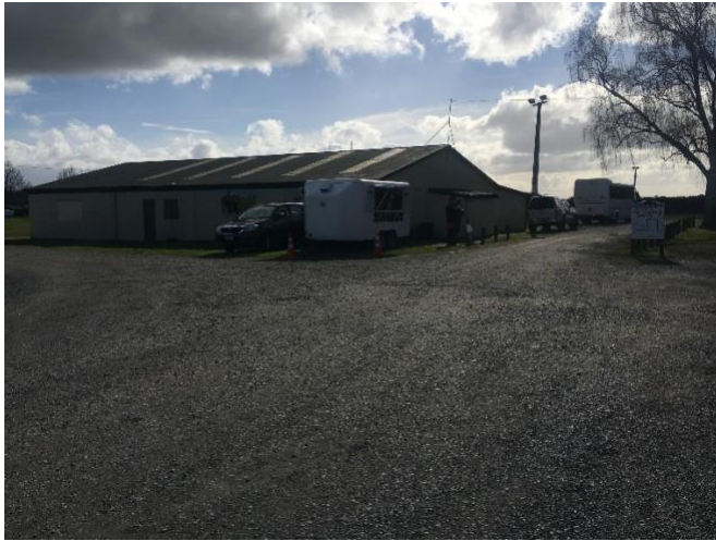
This is a view of the changing rooms for the girls. 12 changing rooms in there.