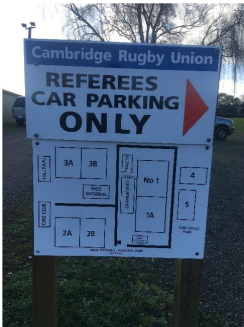
The Cambridge referee parking will be for event organisers and NZL officials only.