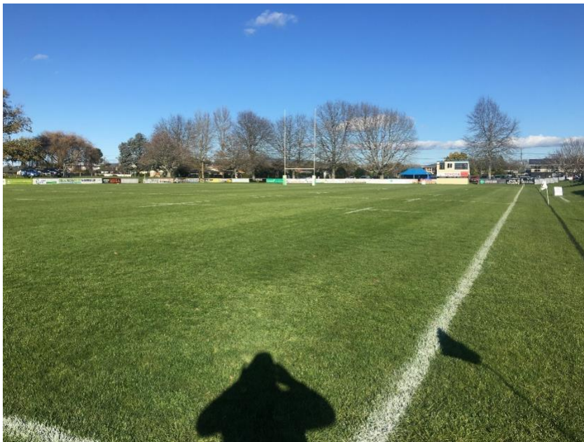
Number 1 field