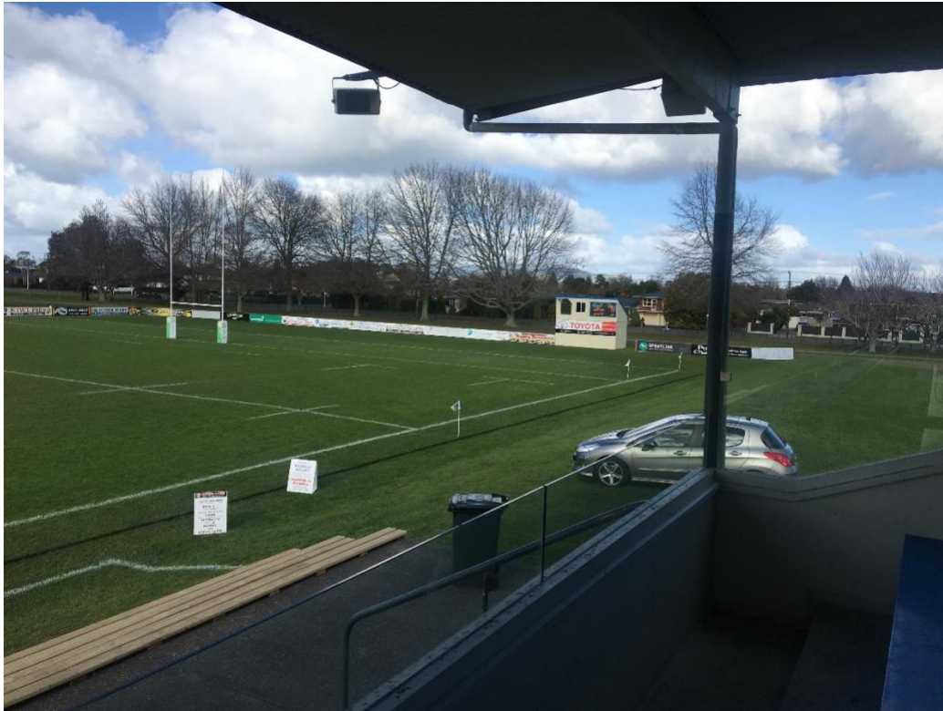
View from grandstand, school tents/gazebos can be placed behind advertising boards, Nets will be up but please take care of stray flying balls.