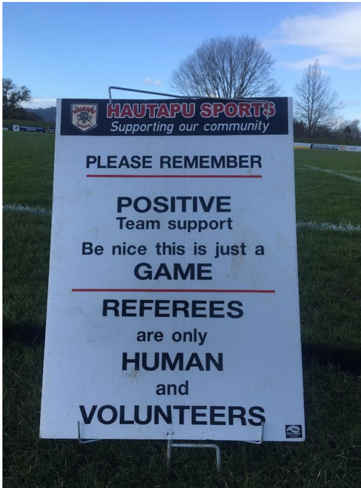
Please remember the above!