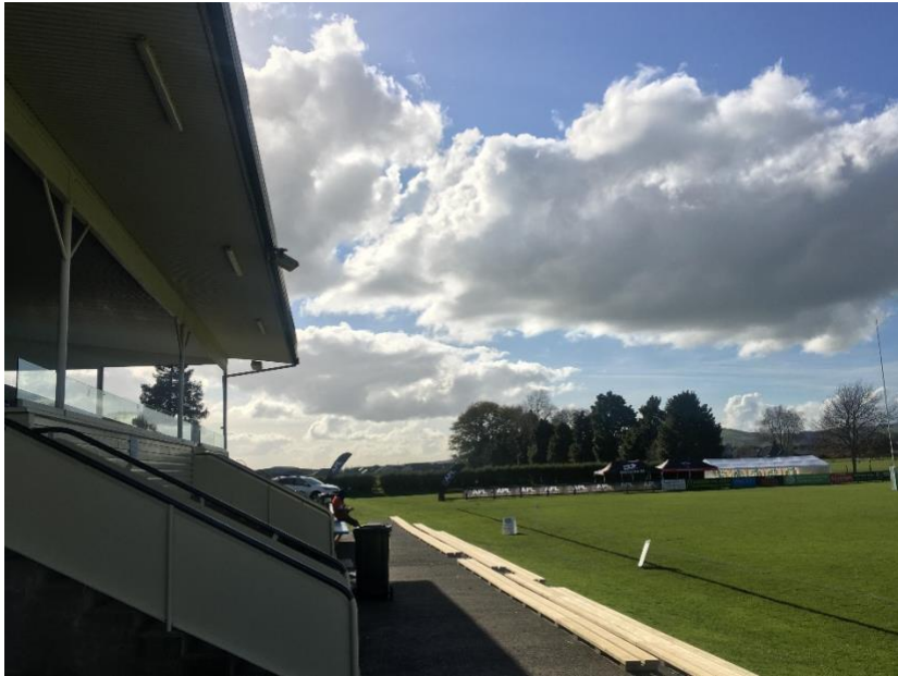
View of Number 1 field