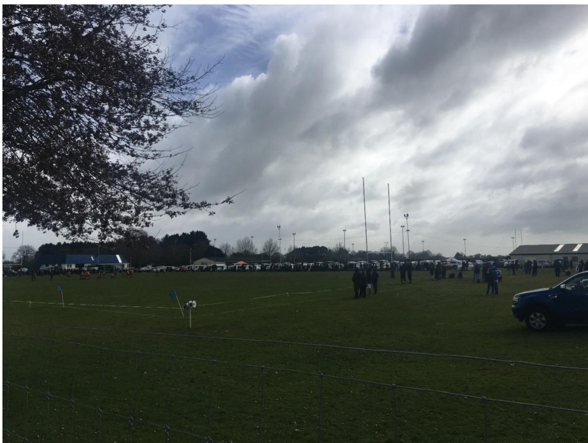
View of field 2 looking towards Hautapu club rooms.